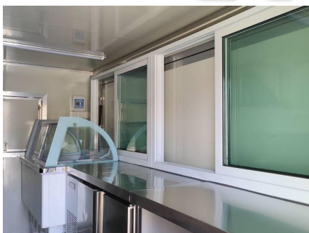
- Interior -