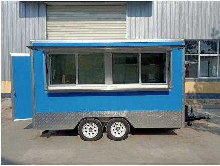
- Original -