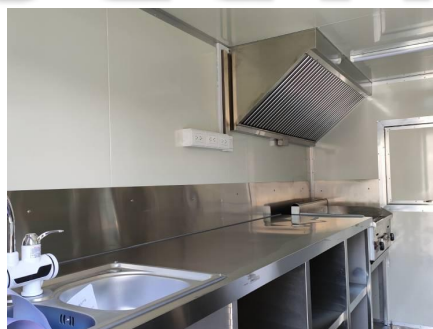
- Interior -