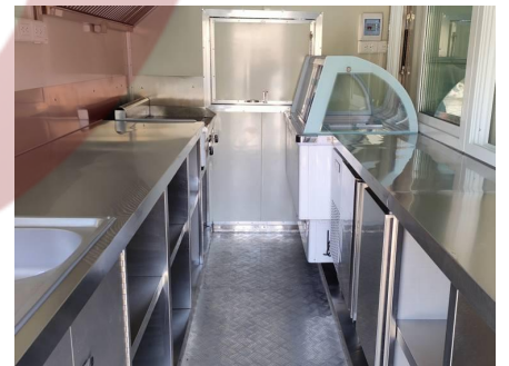
- Interior -