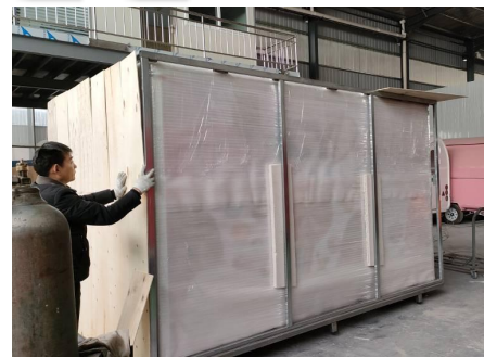
- Trailer Packaging -