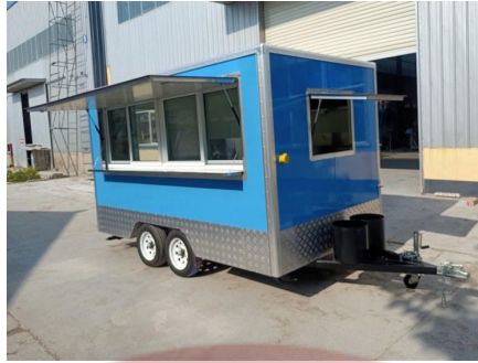
- Original -